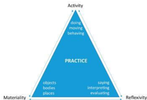
Figure 3 : Elements of practice

The researchers analysed news consumption through a theory of practise lens and the newsmaking and storytelling process. Heikkila and Ahva looked at public research and the digital roles of journalists in 2014. They looked at how people talk to each other in social networks and how people use and talk about the media. Ahva looked at both traditional media and citizen journalism in 2017. Ahva (2016) says that journalists should think about materiality, activity, and reflexivity. Figure 3 depicts journalism elements. Boczkowski, Mitchelstein, and Matassi (2018) were the first to use practise theory to study how people get their news. They looked at how young people in Argentina picked up random news from social media and found four key things: text-materiality, "anytime and anywhere" time-space coordinates, everyday sociability, and text-materiality (or socialisation).